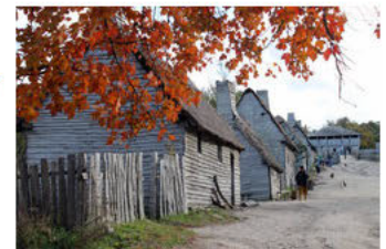
Plymouth Plantation in Fall

Just as they came to marvel at the bounty and beauty of an unfamiliar land, so too can we pause and appreciate the harvest season here in Michigan – where the air is brisk, the trees are heavy with fruit, and the landscape seems to echo with the timeless rhythm of tradition and renewal. Even a trip to a cemetery to honor those who came before us is made more beautiful by the vibrant hues of autumn.