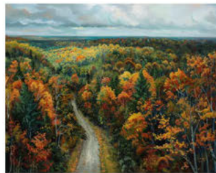
Michigan in Fall

After one of the hottest and driest Michigan summers in memory, the cool breezes of Autumn will be very welcome this year! And as autumn settles over Michigan – painting our fields and forests in vibrant hues of crimson, gold, and amber – it's hard not to feel a special connection to the past. For descendants of the Pilgrims who arrived on these shores in 1620, this cool, crisp season evokes the spirit of gratitude, perseverance, and wonder that defined their first years in this, the New World.