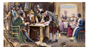
Manning the Sales Table